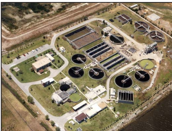
Aerial view of the Bethune Point Wastewater Treatment plant.