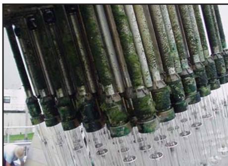
ABOVE: Cleaning systems prevent algae from growing on the UV lamps, but not on the mounting hardware. RIGHT: Algae flourishes on the stainless-steel environment of the UV reactor.

Figure 1 summarizes total fecal coliform in the monthly samples from March 2000 through June 2001. For the first few months of startup, the plant performance simply did not consistently meet the Florida high-level disinfection standards for which it had been designed. After several months of observation, it appeared that there was something more at work than