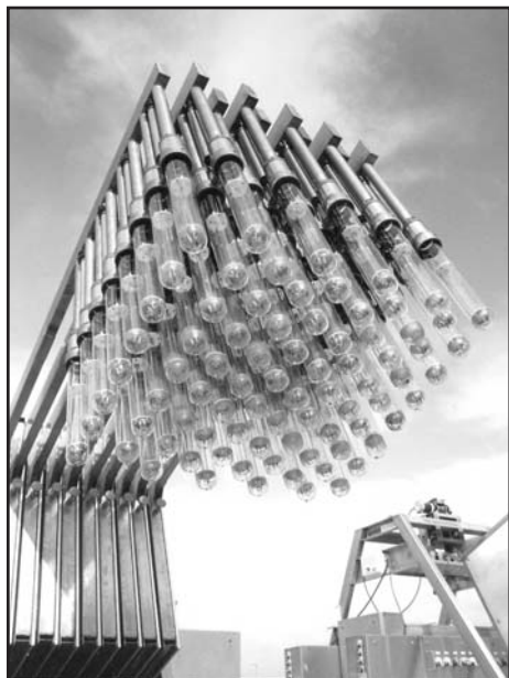
RIGHT: The four banks of UV lights are installed on top of the reactor channel. ABOVE: A view of one of the UV light banks raised out of the water for maintenance.

McKim & Creed designed the first large-volume, unrestricted public access reuse application for UV light disinfection to be permitted in Florida. During the design process, MCE and city staff visited numerous facilities in California to learn from their experiences. Many of the California sites were under construction or had recently gone into service, so no longtime history on the specific equipment was available.