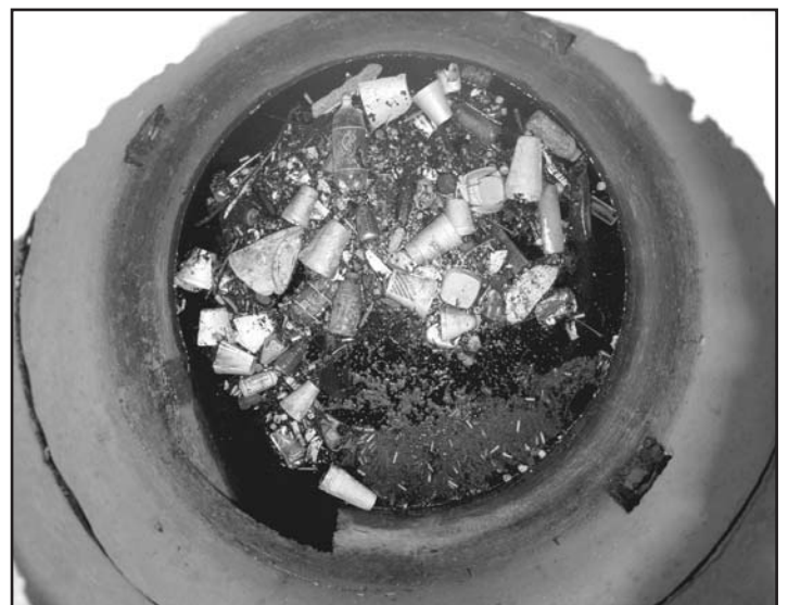
Pollutants trapped in the CDS sump can not be flushed back into the drainage system.