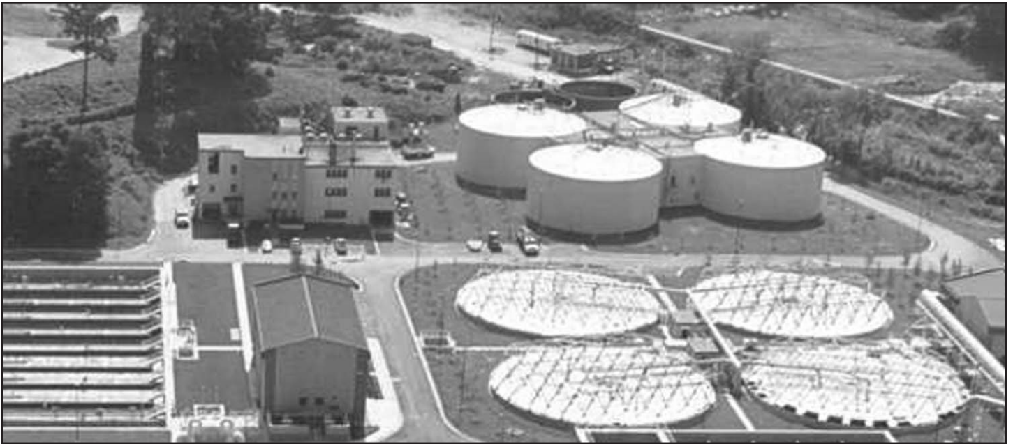
This view of the dewatering/incineration building and digester complex at Atlanta's Utoy Creek Water Reclamation Center shows the newly covered primary clarifiers and thickening centrifuge building in the foreground.