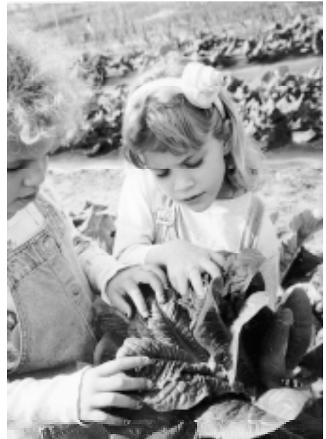
Kindergarten students from Taylor Ranch Elementary School examine lettuce grown in their water conserving garden.

Education about water conservation needs to be an integral part of school curriculum. Creating a hands-on learning environment enhances interest and serves as a practical laboratory to reinforce concepts.