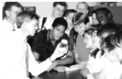
The author shows students treated effluent.

The Adopt-A-School program is being sponsored by the FWEA Public Education Committee to encourage members to interact with the schools in their area and provide them with a contact person who can assist them in enhancing their knowledge on environmental matters, give tours of treatment facilities as well as a supplying the school with a complete set of the WEF video curriculum series. The series includes units on wastewater treatment, surface water, ground water and water conservation. If you would like more information on Adopting-A-School, contact Julie Karleskint with the Public Education Committee at 941-925-3088.