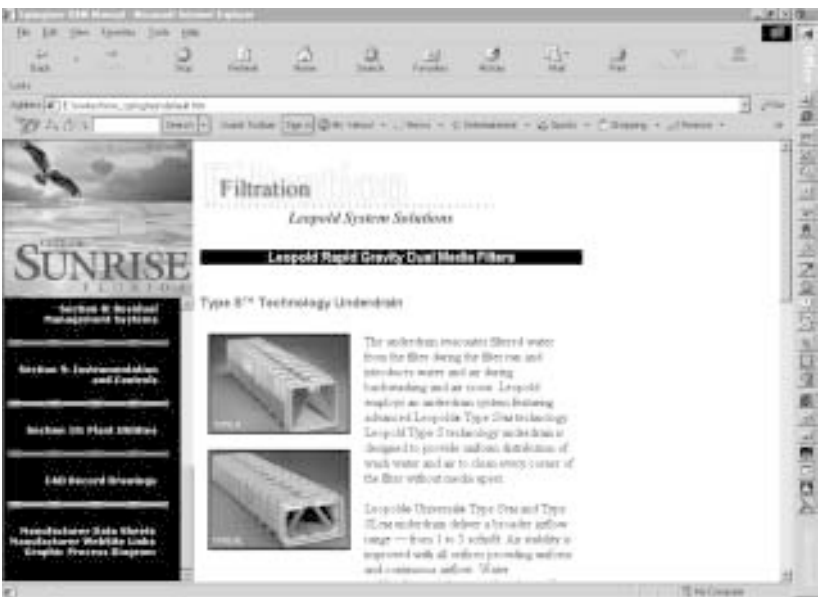
Internet Web site of the underdrain supplier for the filters at the Springtree WTP.