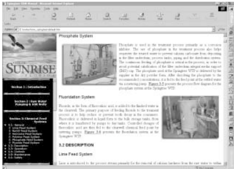
Description of the chemical feed system in Section 3 of the manual.

Collectively, the benefits of an on-line system can reduce a utility's annual operations and maintenance expenses. Significant savings can be achieved by increasing information accuracy, currency, availability, and portability, as well as decreasing training, maintenance overtime, and risk factors. ■