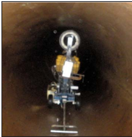
Crawler mounted RFEC/TC and video

The DWU had not historically specified bonding joints or sacrificial anode beds as part of its corrosion control system on PCCP assets. However, geotechnical studies revealed “hotter” soils moving along the line westward toward Dallas that prompted DWU to do a corrosion study and design an