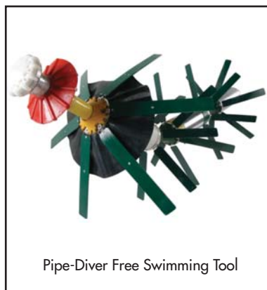
Pipe-Diver Free Swimming Tool