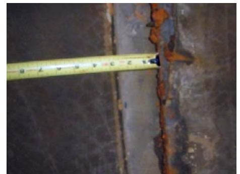
Measuring joint deflection in 54 in. pipe