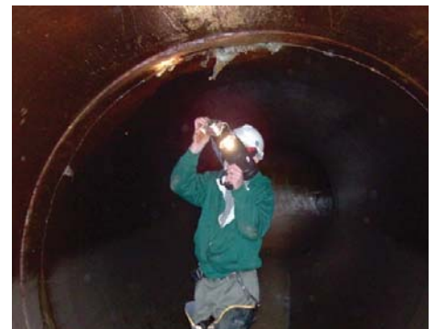
Inspection of PCCP Joints