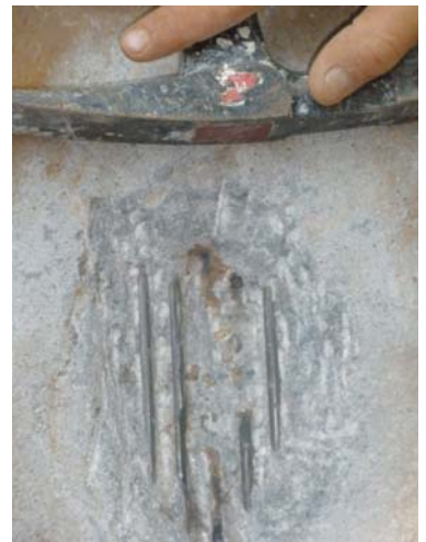
Broken prestressing wires

vered its diagnostic equipment along the steep grades of the water main. The initial investigation revealed several possible locations with deficient wires.