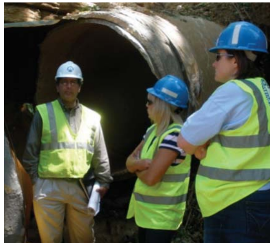
Vehicle-sized hole in 60" PCCP