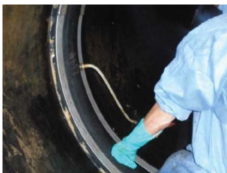
Injecting internal seal adhesive