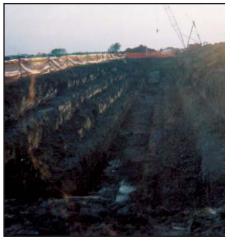
Stepped excavation during PCCP replacement