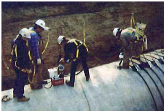
Steel tendon installation on PCCP